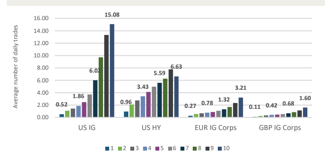
Figure 2: Average daily trade count by Relative Liquidity Score and market (FY 2021)

The proprietary MarketAxess Relative Liquidity Score provides a consolidated measure of the current liquidity of an individual bond, using factors such as trading activity, MarketAxess platform inquiry activity and platform dealer activity. The methodology covers approximately 33,000 bonds daily. Scores range from one to ten, where ten indicates the highest level of liquidity and one the lowest.